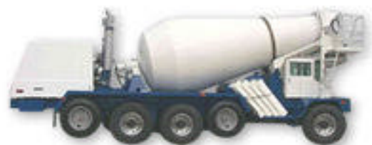
Five axle mixer