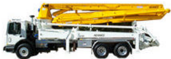
37 meter pump