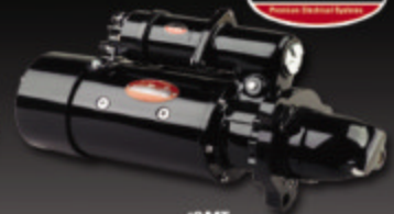
42MT Straight-Drive Starter