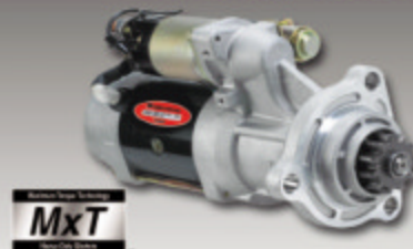
29MT, 38MT & 39MT MxT™ (Maximum Torque Technology) Gear Reduction Starters