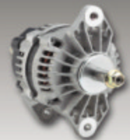
24SI Dual Internal Fan Brush Alternator

Customer Support Line: 1.800.372.0222 For additional product information and how to order, go to www.remyinc.com