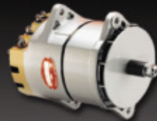
34SI Premium Brushless Alternator