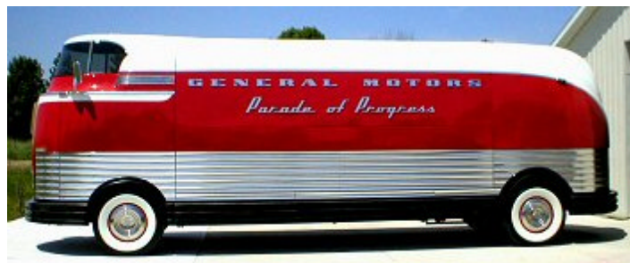
1953 Futurliner (under restoration in Michigan)