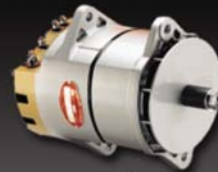
34SI Premium Brushless Alternator