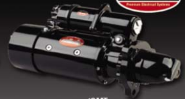
42MT Straight-Drive Starter