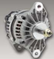
24SI Dual Internal Fan Brush Alternator

Customer Support Line: 1.800.372.0222 For additional product information and how to order, go to www.remyinc.com