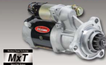
29MT, 38MT & 39MT MxT™ (Maximum Torque Technology) Gear Reduction Starters