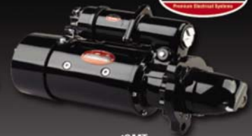
42MT Straight-Drive Starter