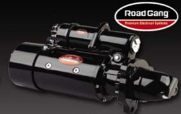
42MT Straight-Drive Starter