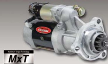
29MT, 38MT & 39MT MxT™ (Maximum Torque Technology) Gear Reduction Starters