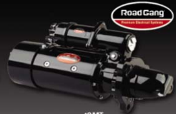
42MT Straight-Drive Starter